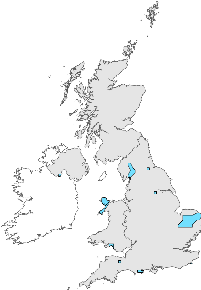
Figure 2: UK range map for H7210 - Calcareous fens with Cladium mariscus and species of the Caricion davallianae . Coastline boundary derived from the Oil and Gas Authority's OGA and Lloyd's Register SNS Regional Geological Maps (Open Source). Open Government Licence v3 (OGL). Contains data © 2017 Oil and Gas Authority.

The range map has been produced by applying a bespoke range mapping tool for Article 17 reporting (produced by JNCC) to the 10km grid square distribution map presented in Figure 1. The alpha value for this habitat was 25km. For further details see the 2019 Article 17 UK Approach document.