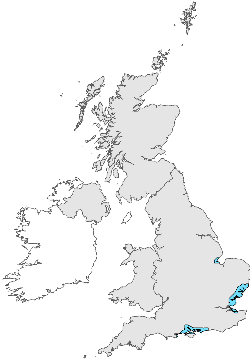
Figure 2: UK range map for H1320 - Spartina swards ( Spartinion maritimae ). Coastline boundary derived from the Oil and Gas Authority's OGA and Lloyd's Register SNS Regional Geological Maps (Open Source). Open Government Licence v3 (OGL). Contains data © 2017 Oil and Gas Authority.

The range map has been produced by applying a bespoke range mapping tool for Article 17 reporting (produced by JNCC) to the 10km grid square distribution map presented in Figure 1. The alpha value for this habitat was 25km. For further details see the 2019 Article 17 UK Approach document.