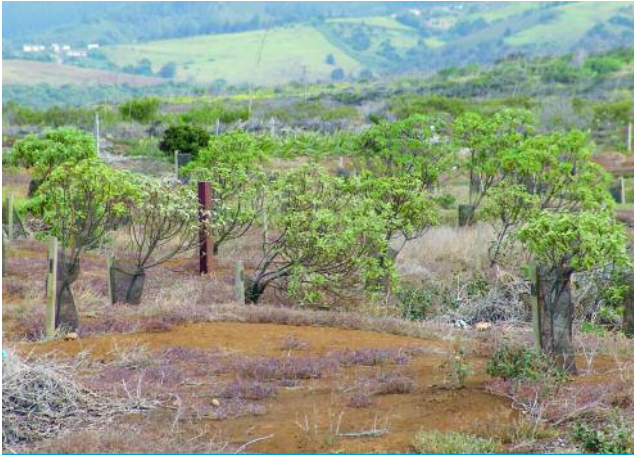
A large reforestation scheme is underway in Millennium Forest, St. Helena.