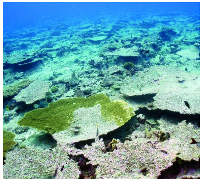
Coral killed by warming sea temperatures in the BIOT.