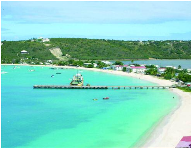
Anguilla Harbour is vulnerable to sea level rise due to its low-lying location.

from energy sources, emissions are still increasing globally. What we do over the next 10 to 20 years will have a huge effect on the climate in the second half of this century and on into the next. 2 Ultimately, the choice is ours. We can act now to reduce emissions, particularly those from energy sources, or devote ever-increasing amounts of time and resources to coping with the effects of warming on the economy, the environment and our lifestyles.