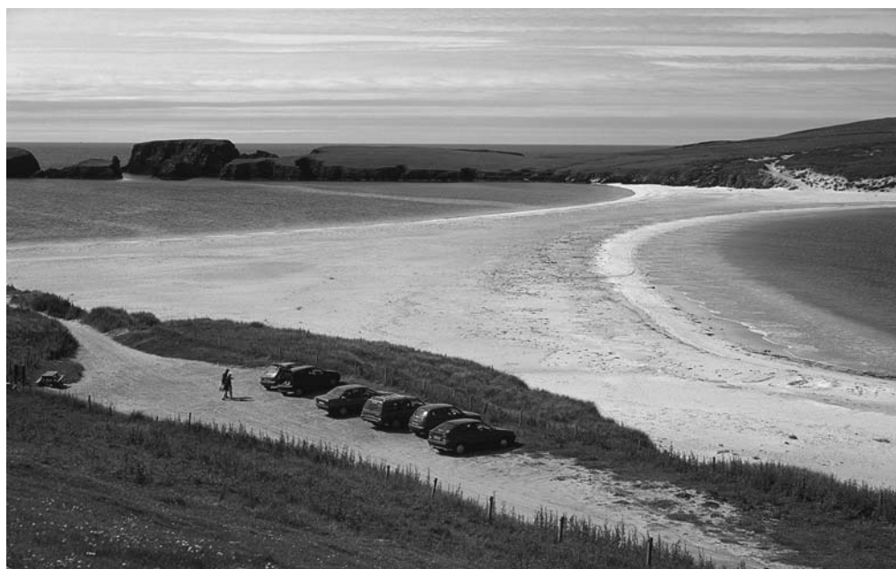
Figure 8.23: St Ninian's tombolo, looking south-west towards St Ninian's Isle. Dunes flank either extremity of the sandy tombolo. During the highest spring tides the central part may be completely covered in water.

St Ninian's tombolo, the largest geomorphologically active sand tombolo in Britain, is a classic geomorphological feature of national importance. The tombolo links the south-west Shetland Mainland to the small off-lying island of St Ninian's Isle (Figure 8.23). Although tombolos are by no means rare in an archipelago environment, they are numerically scarce relative to other classic forms of marine deposition (spits and bars). In the Northern Isles, tombolos (ayres) are generally formed of gravel, cobbles or occasionally boulders. St Ninian's tombolo is distinctive among its fellows in being composed mainly of sand. In addition, unlike many other ayres that are relict in terms of their evolution and relationship to contemporary sea level, St Ninian's tombolo is a geomorphologically active feature linked to a nearshore sediment circulatory system (Nature Conservancy Council, 1976; Smith, 1993; Bentley, 1996d). The tombolo is flanked on either end by areas of dunes and hill machair, enhancing the geomorphological interest. This almost perfectly formed feature set in a highly scenic part of the Shetland Isles must be one of the most outstanding tombolos in the world.