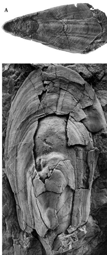
Figure 4.21: Althaspis senniensis : (A) rostral plate from Hoel Senni Quarry; (B) a ventral disc from Hoel Senni Quarry (after Loeffler and Thomas, 1980), both approximately natural size.

Althaspis leach White, 1938 is the only other pteraspid from Besom Farm Quarry. Its type locality is Swanlake Bay, Dyfed, but it also occurs at Mitcheldean Quarry, various sites in the Clee Hill area and in France and Belgium. Thus it provides a useful means of correlation with continental strata of Pragian age, partially filling a stratigraphical gap between the 'crouchi-rostrata' Zone of the Dittonian and the 'dunensis' Zone of the Breconian (White, 1956, 1960). Althaspis is defined by the presence of an extensive subrostral surface covered with dentine ridges, and lacking a preoral field (Denison, 1970; Dineley and Loeffler, 1976). It was redescribed by White (1961), based mainly on material from Besom Farm Quarry. The other British species of Althaspis is A. senniensis Loeffler and Thomas, 1980 from the Senni beds of Powys (Figure 4.21).