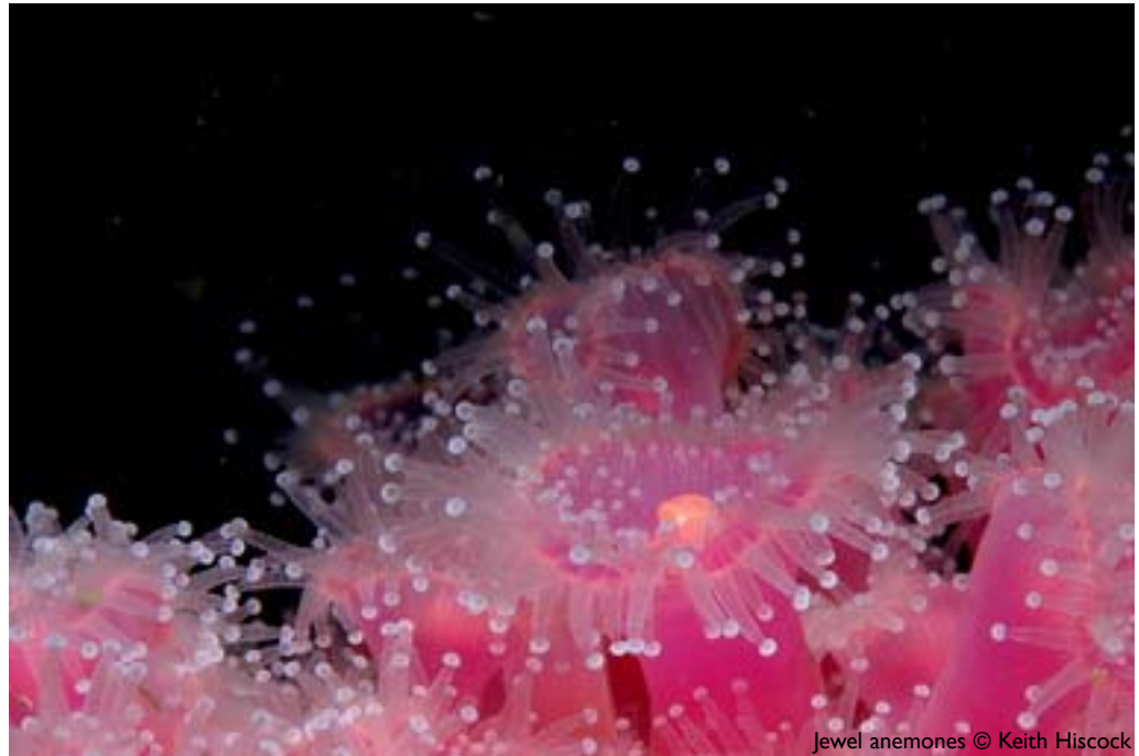
Jewel anemones

Each regional MCZ project will also prepare an Impact Assessment that will set out the anticipated costs and benefits of the proposed network of sites and identify the environmental, social and economic implications.