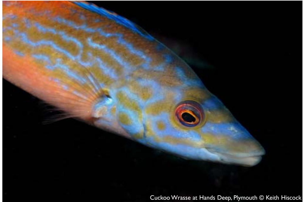
Cuckoo Wrasse at Hands Deep, Plymouth

To influence the decisions on where MCZs are located, national and international stakeholders will need to have representation on the stakeholder groups for the regional MCZ projects or become a Named Consultative Stakeholder. At a national and international level there is also a UK MPA Stakeholder Forum. This forum is intended to provide UK national stakeholder bodies, and equivalent international groups, with information about the work of the MPA projects in the UK and the opportunity to know more about key strategic issues.