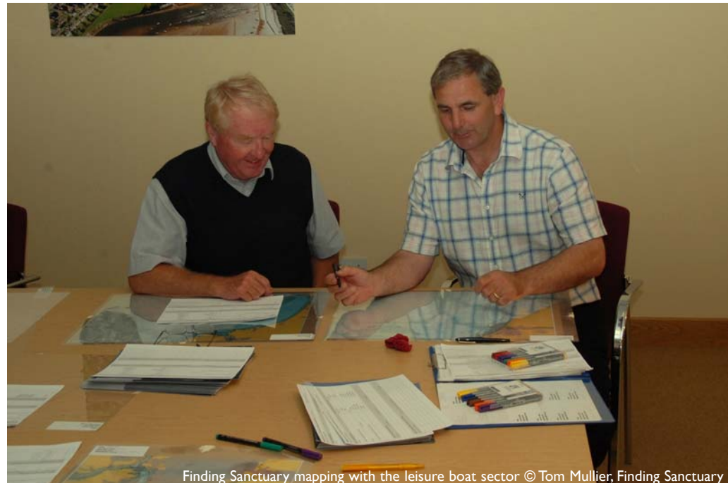
Finding Sanctuary mapping with the leisure boat sector

The data collected by the project teams from sea users will be used to develop the stakeholder groups' knowledge of their region, so that they have a good understanding of the marine environment and of which areas are important to different sea users, helping them to plan MCZs carefully. An interactive map has been launched to allow sea users to view the data that has already been gathered and to enter information on areas of the sea that are important to them.