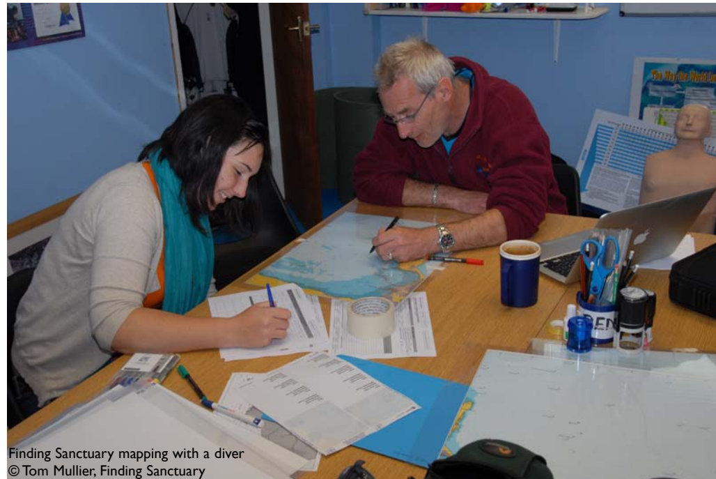
Finding Sanctuary mapping with a diver

We don't yet know where MCZs will be. It is the job of the regional MCZ projects to identify MCZs by putting sea users and interest groups at the centre of the site selection process. In contrast to the designation of European sites, the designation of MCZs may take socio-economic factors into account, as long as these factors do not undermine the creation of the network. This will ensure that a network of sites can be achieved in a way that minimises adverse impacts on sea users and maximises benefits for nature conservation.