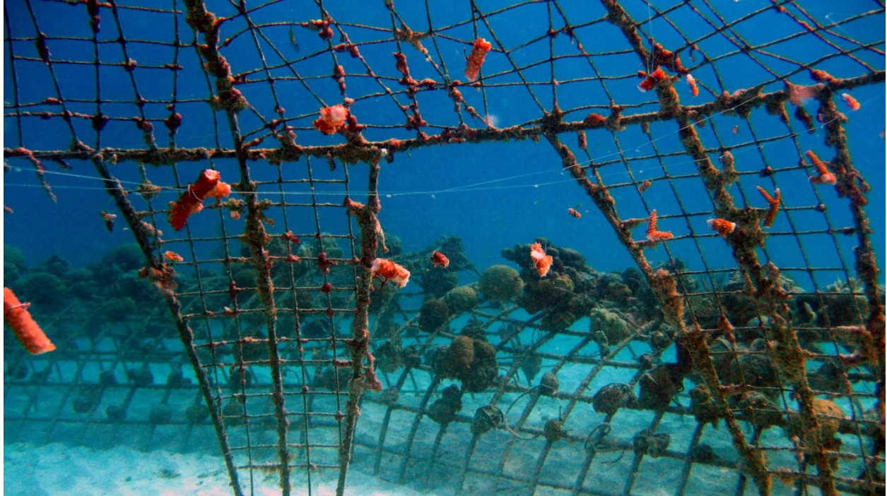
Figure 3. Partial view of Acropora sp. fragments in the nursery. Summer 2010

Consequently, the nursery has been successfully established and the goal of the project achieved. However this is just the first stage of the nursery which requires long-term monitoring and maintenance. During the next stage (in principle 4 to 5 weeks), the structure would be left without power to monitor coral health and growth in those conditions. Once health and growth are properly recorded, the structure would be powered only during daylight using a timer that will turn the power off at night. The dome-shape of the structure creates ideal conditions to subject the corals to the electrical field without being directly attached to the structure. Coral growth and health would be then recorded under these new conditions and compared with the previous records without power. According to the conclusions of this comparison it would be decided if more corals should be transplanted onto the structure.