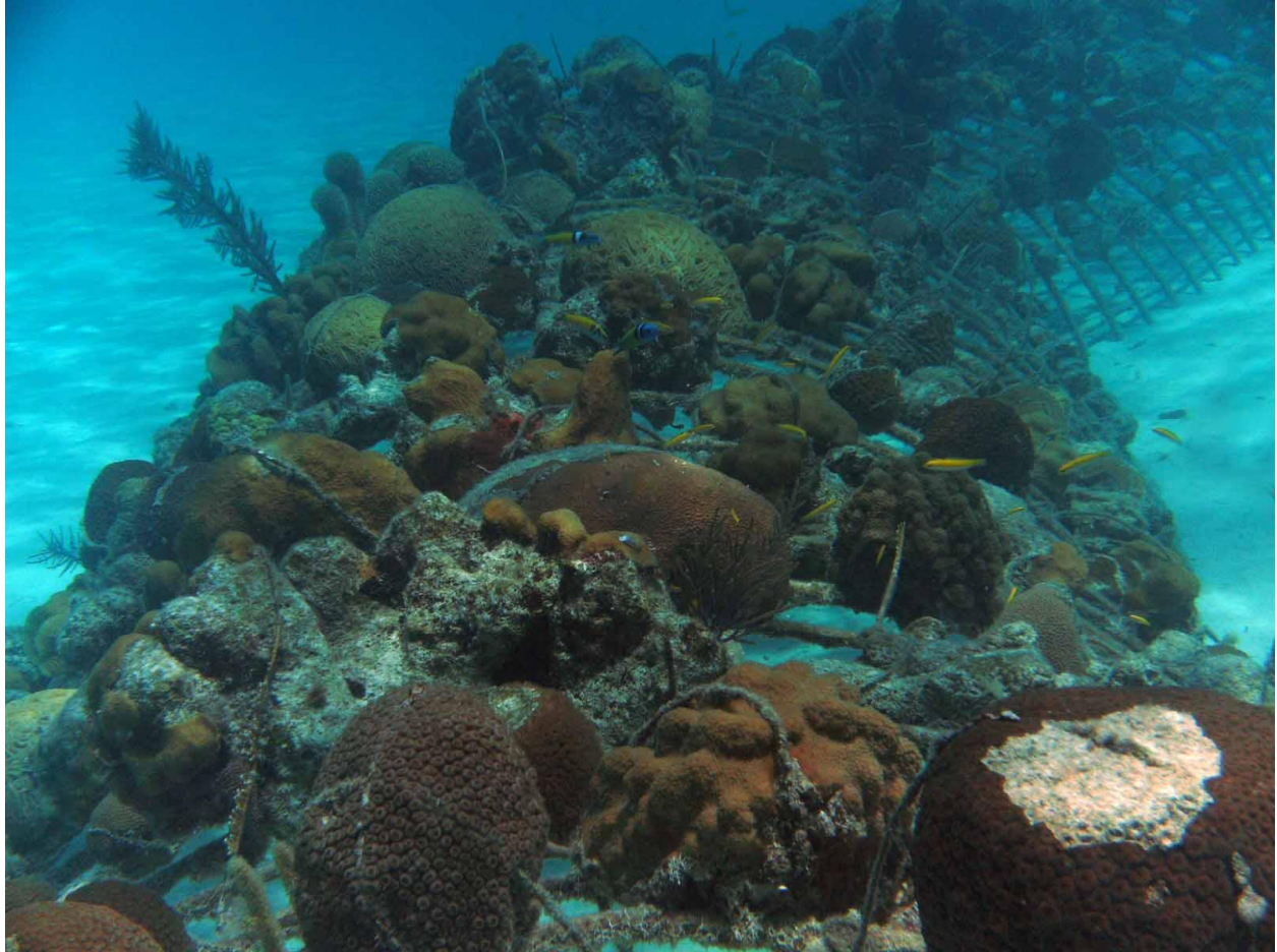
Figure 2. Partial view of Governor's Beach Biorock Project. Spring 2010

In summer 2010 more than 50 fragments of corals were transplanted onto the structure. These fragments were obtained from still alive parts of damaged Acropora sp corals, located at Chief Minister's dive site, the closest to Governor's Beach Biorock Project. The fragments were not directly attached to the structure but hanged on a nylon fishing line. This method was used to avoid damaging the coral fragments because, being very small, if they had been attached directly onto the structure with steel tie wires (traditional method for Biorock projects) it would have affected their growth negatively