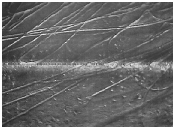
(c) Paper record showing isolated Sabellaria spinulosa reef features alongside aggregate suction trailer dredge tracks, collected using an analog sonar system.