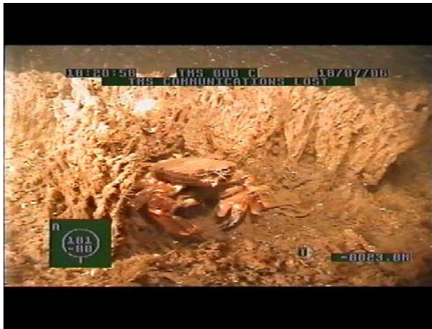
(a) Still image grabbed from sledge mounted video camera footage