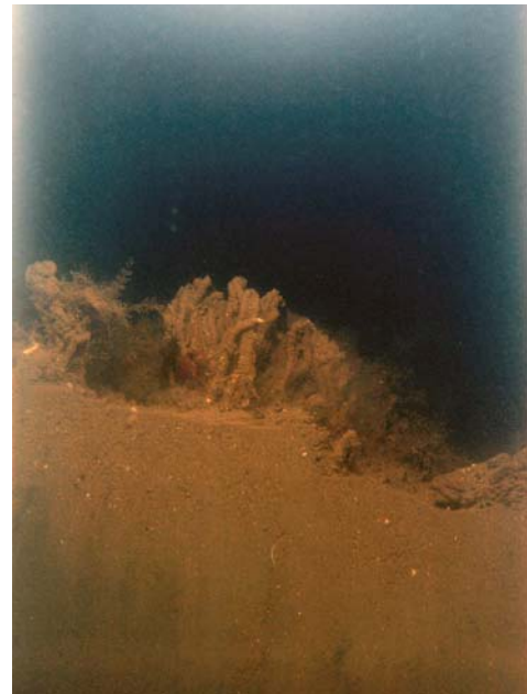
(b) Vertical profile through the reef/sediment interface taken using a Sediment Profile Imaging camera