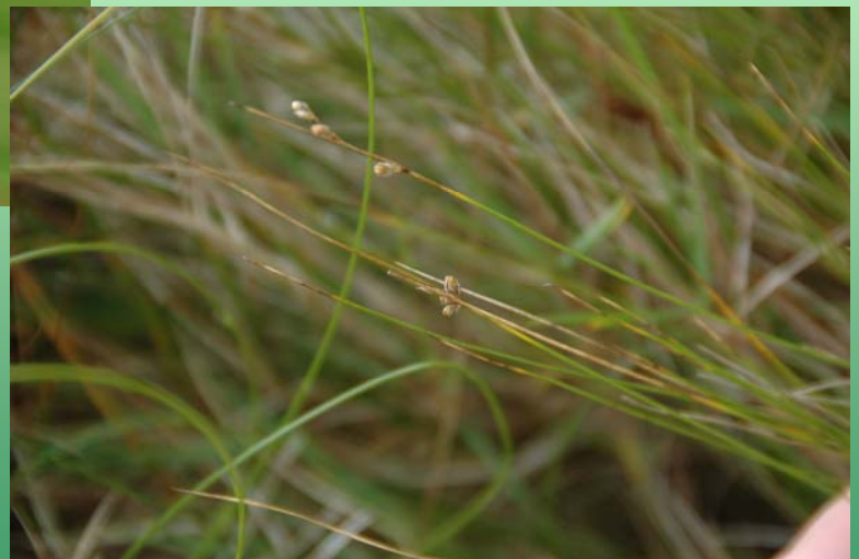
Bullgrass Juncus tenuis . Photo: Andrew Darlow