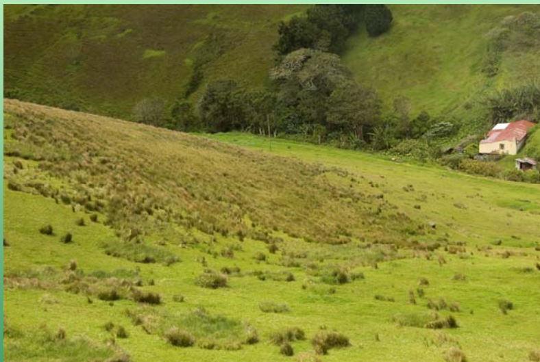
Juncus tenuis in pasture at Osbornes.