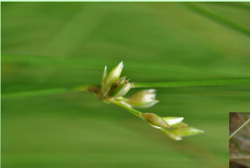
Bullgrass Juncus capillaceus .