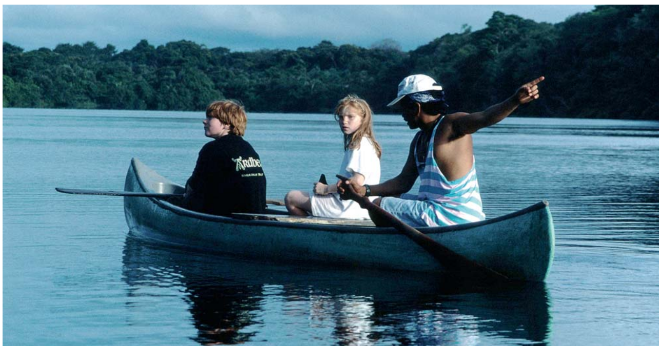
Properly managed ecotourism has the potential to give significant economic inputs to protected and other areas in developing countries. Costa Rica.