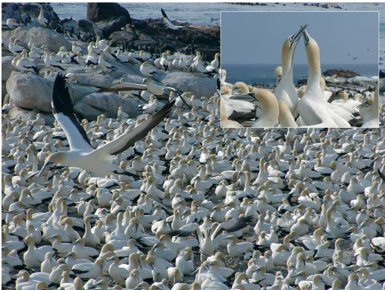
Cape Gannets Morus capensis at Lamberts Bay, western Cape. Photo: Dieter Oschadleus.

Inset: Displaying Cape Gannets Morus capensis at Lamberts Bay, western Cape. Photo: Dieter Oschadleus.