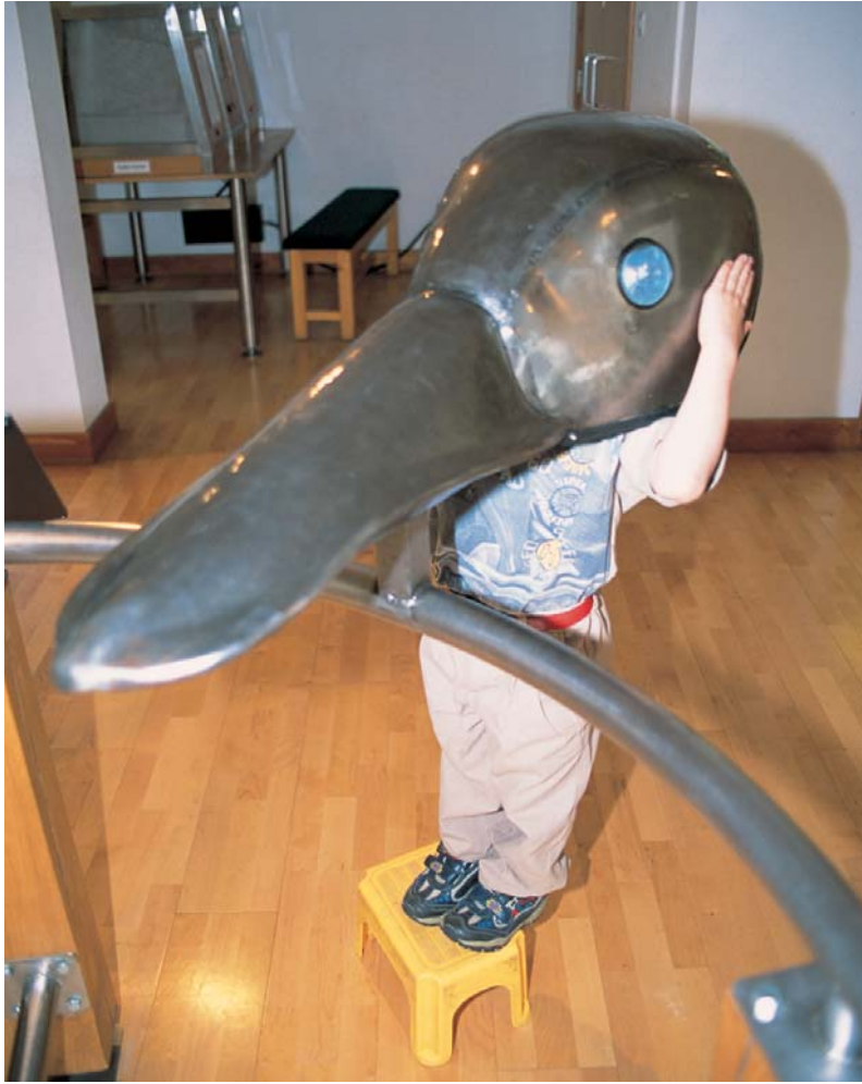
Seeing the world through duck eyes.