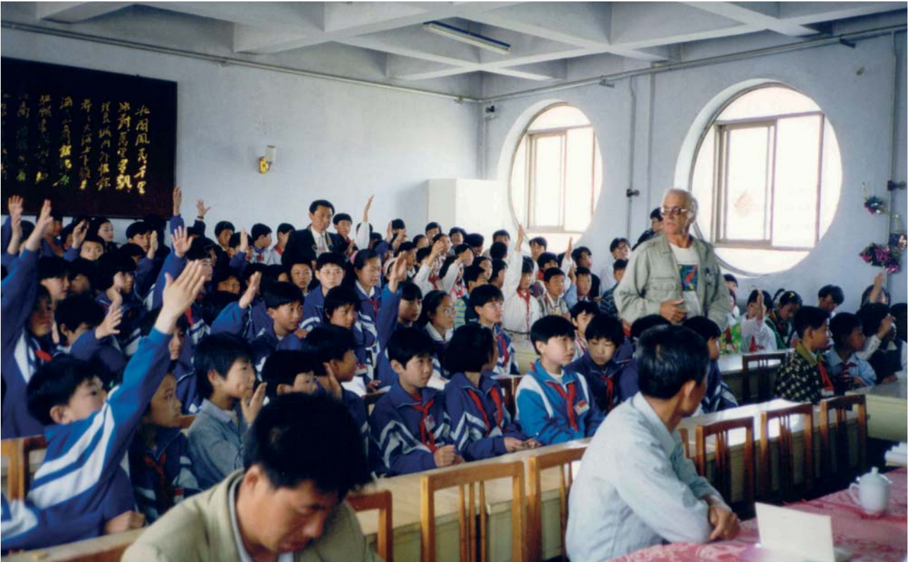
Education and awareness raising is a crucial element of any conservation programme. Talking to schoolchildren at Shuangtaizi Hekou National Nature Reserve, Liaoning Province, China (Yellow Sea).