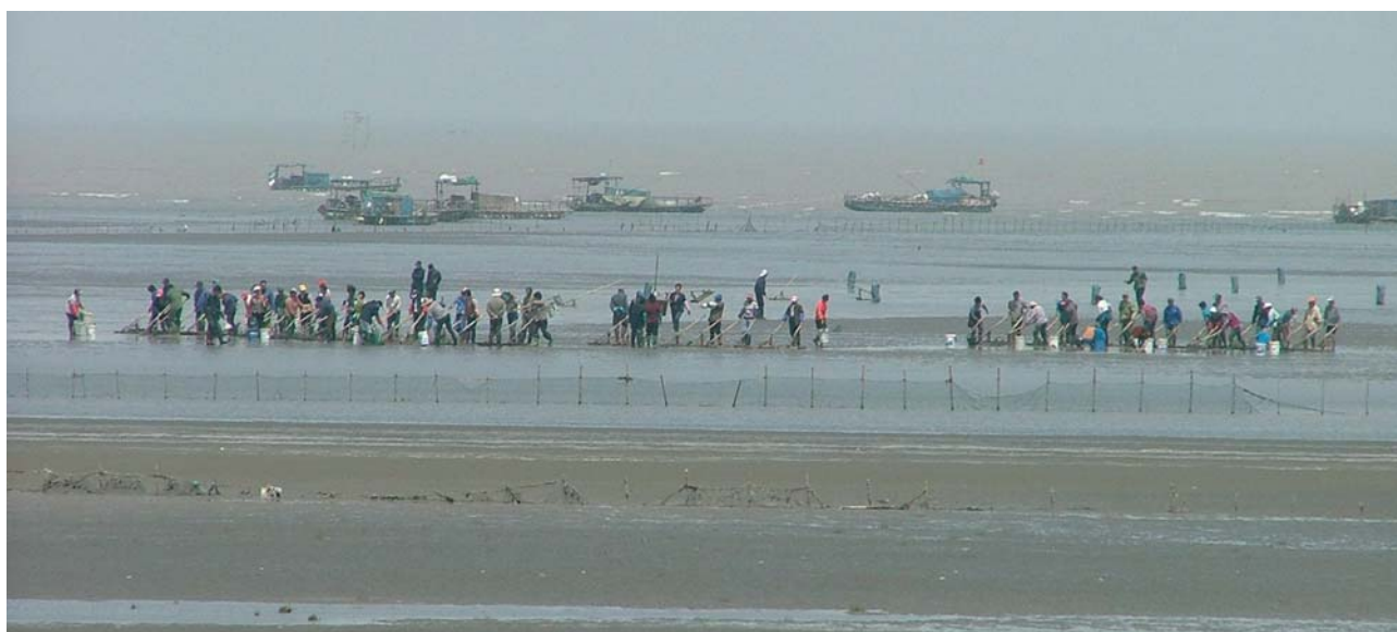
Over a third of the world's human population occurs in East Asia and Australasia. The region's wetlands support dense human populations and are subject to a wide range of pressures and threats which have major implications for the many waterbirds that share these areas. Shellfishing in Fujian Province, China (Yellow Sea).