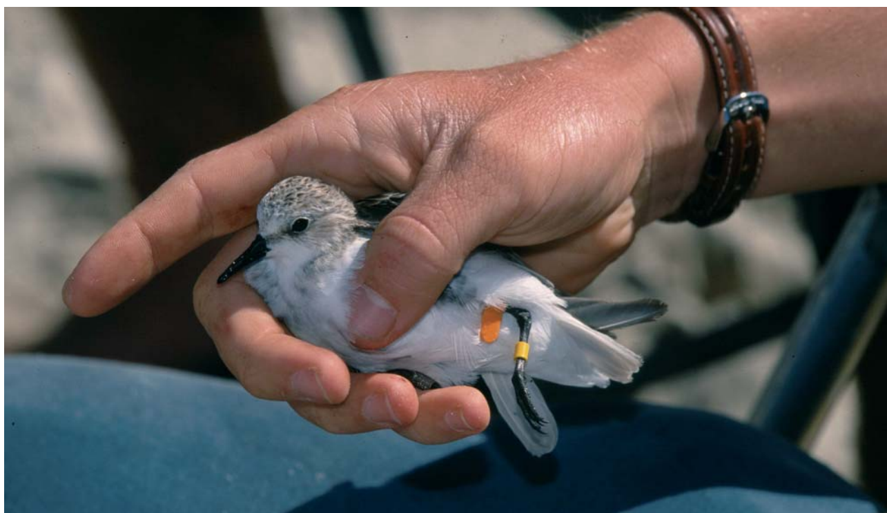
A Red-necked Stint Calidris ruficollis colour marked in Australia. Many thousands of stints pass through Kamchatka on spring and autumn migration, and colour-marking has assisted in understanding the migration ecology of this species on the East Asian – Australasian Flyway.