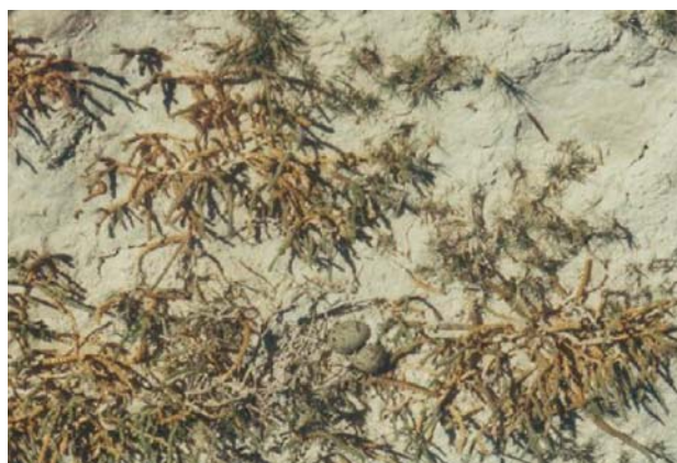
A nest with two eggs of Madagascar Plover at Lake Tsimanampetsotse, February 2004.