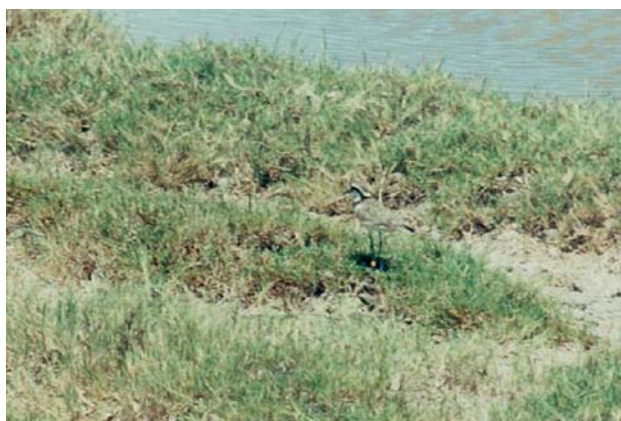
A Madagascar Plover adult at Ifaty in its preferred habitat, ringed December 2002 (Yellow on left leg), seen again February 2004.