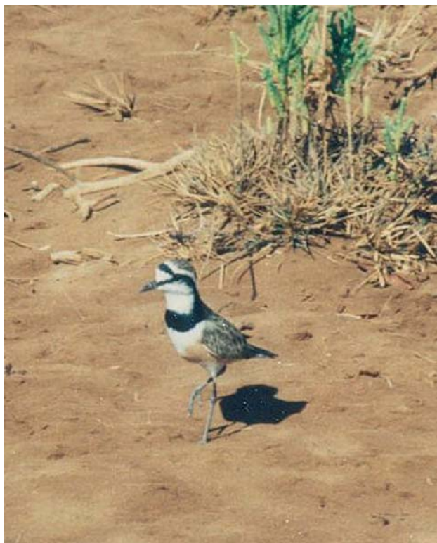
Madagascar Plover Charadrius thoracicus adult at Mahavavy delta (Andolomikopaka), August 2003.

Major wetlands were surveyed in the west coast of Madagascar both during the wet and dry seasons. The surveys showed that the Madagascar Plover has wider geographic distribution than previously thought, the breeding sites are scattered, and the number of plovers appears to fluctuate at most sites. The Madagascar Plover coexists with two other plover species, Kittlitz's Plover Charadrius pecuarius and the White-fronted Plover Charadrius marginatus , with which it appears to compete for nest sites. We designated areas for a population study, ringed adults and chicks and took morphological measurements. We anticipate that the surveys and population monitoring will enable us to estimate the total number of individuals of this endemic plover, and we will then be able to project its future population changes.