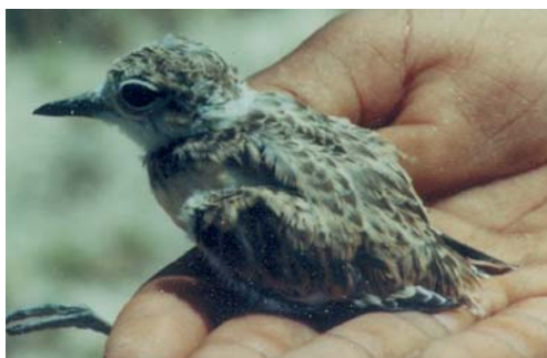
Madagascar Plover juvenile captured at Andrikaela, February 2004.