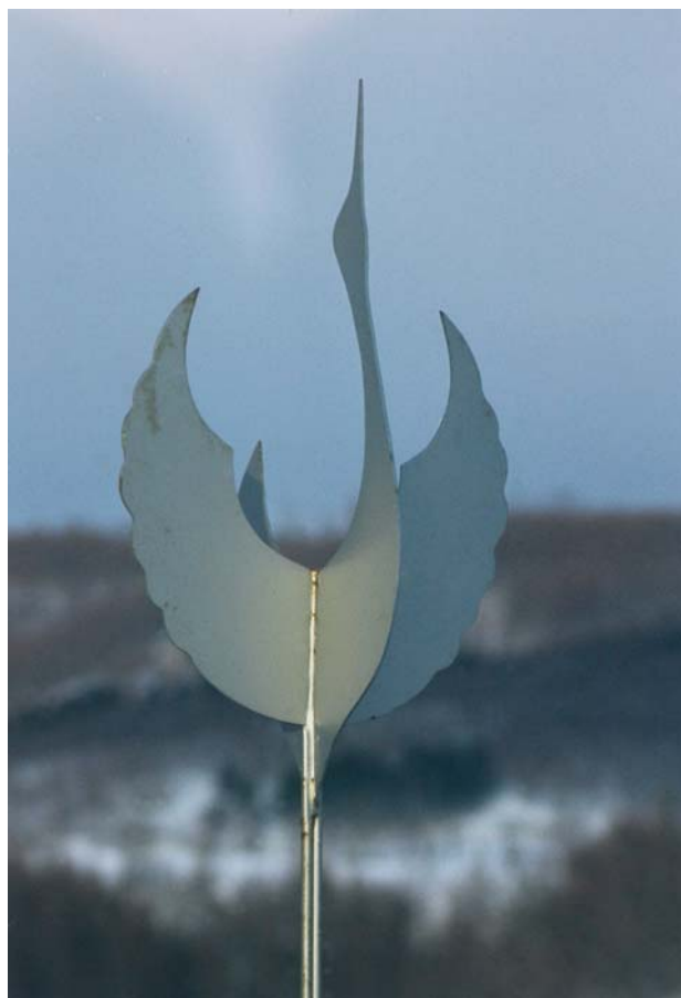
Fig. 4. Japanese crane symbol, where waterbirds, wetlands and culture meet.

In Asia, attention was initially focussed mainly on shorebird (wader) flyways, under the co-ordination of the Asian Wetland Bureau (e.g. Parish & Prentice 1989). International waterbird counts and wetland inventories stimulated many Asian countries into further conservation actions, and this was also the case in Latin America. In many biogeographical regions, specific initiatives relating to wetlands developed into powerful regional organizations (cf. MedWet). Other thematic groups worked on specific wetland types and programmes (peatlands, lakes, riverine systems, dunes and estuaries, etc.). National overviews of waterbird counts and wetlands became available in many countries; in this regard, the states of the former USSR were