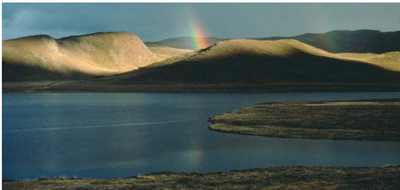
Part of the Ramsar site of Eqalummiut nunaat – Nassuttuup nuna, west Greenland, designated in 1987 because of its international importance for breeding waterbirds.