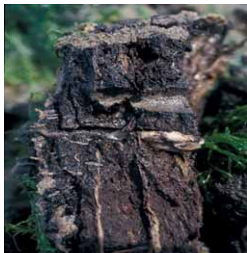
Figure 9. Clay exposure with dead piddock image collection, Anon.)