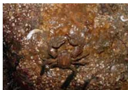
Underboulder community of barnacles and bryozoans with the hairy porcelain crab Porcellana platycheles , (Image: CCW)