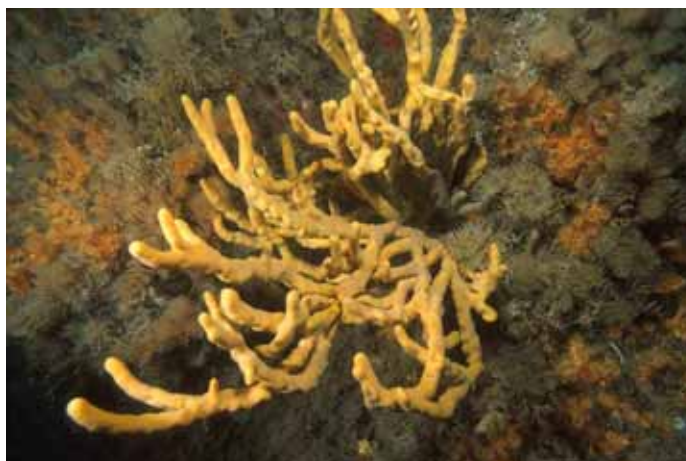
showing a large specimen of the sponge Axinella dissimilis .

Zone/depth Upper circalittoral and lower circalittoral