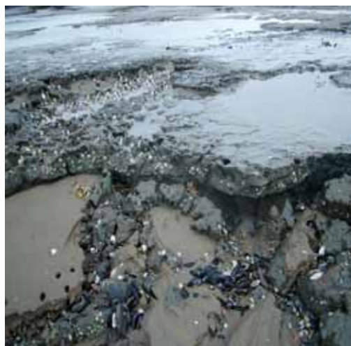
Figure.10 Piddocks in peat. (Image: JNCC shells. (Image: CCW).