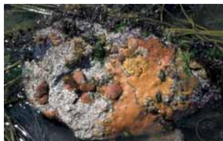
Diverse underboulder community including encrusting sponges and the bulbous bryozoan Turbicellepora magnicostata .