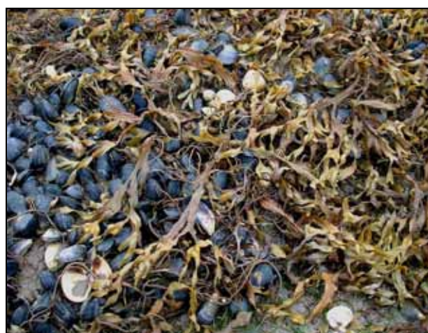
Blue mussel, Mytilus edulis on intertidal sediment.