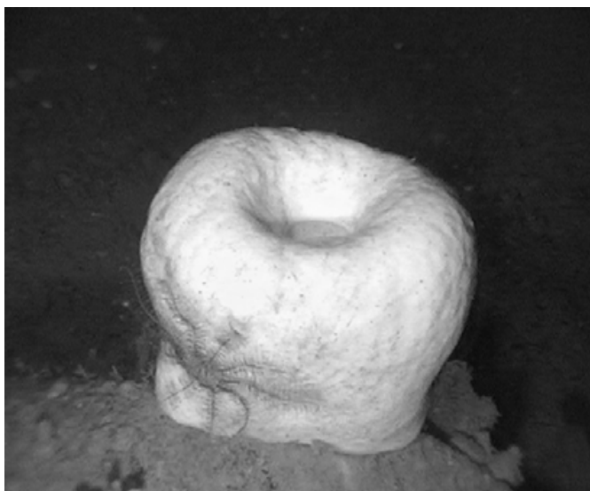
Geodia sponge