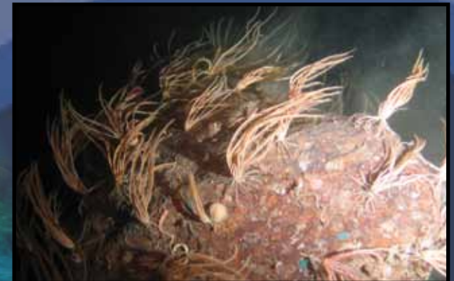
Featherstars Leptometra celtica , calcareous tube worms and the blue sponge crust Hymedesmia paupertas on bedrock and boulder reef