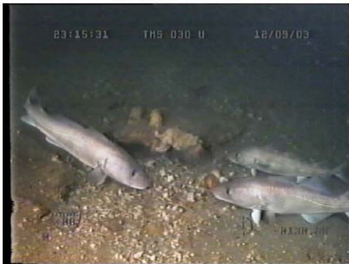
Plate 3: (Pockmark A) Carbonate cemented rock pavement and shell gravel with cod, Buccinid egg masses and epifauna (sponges and the anemone Bolocera tuediae ).