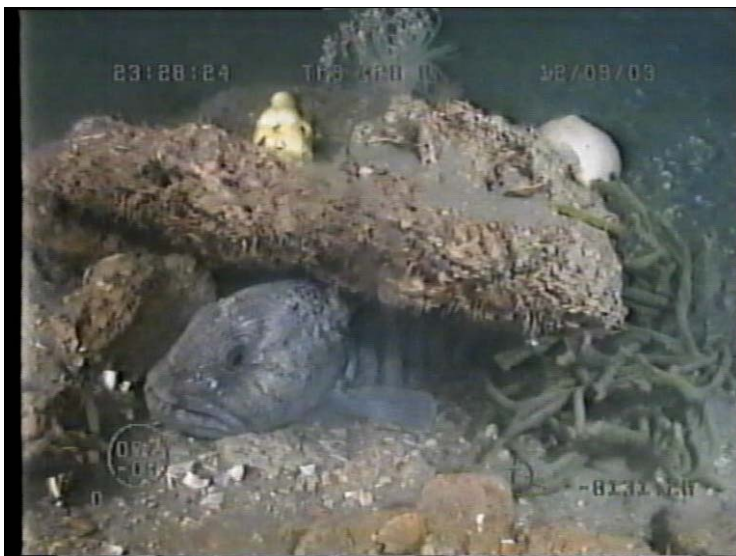
Plate 1: (Pockmark A) Carbonate cemented rock slab with wolf-fish, Buccinid egg mass and epifauna including Bolocera tuediae .