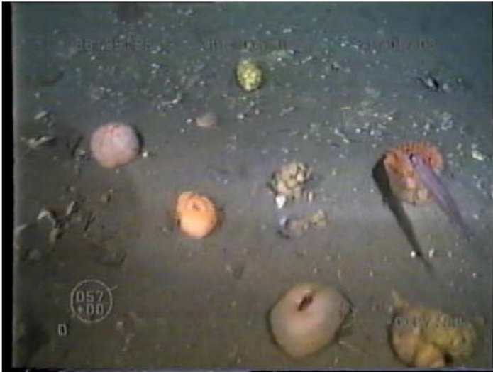
Plate 2: (Pockmark A) Mixed seabed with buried carbonate cemented rock, shell gravel and muddy sand. Visible fauna includes Bolocera tuediae , Buccinid egg masses and juvenile gadoid fish.